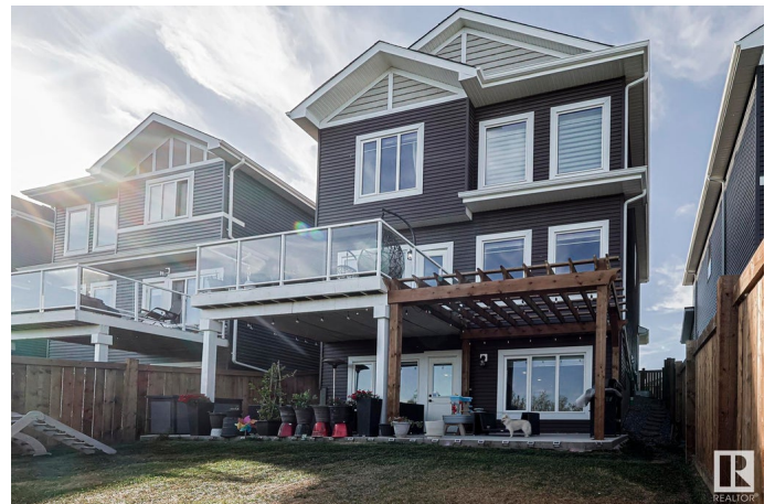
880 Ebbers Cres NW, Edmonton, AB